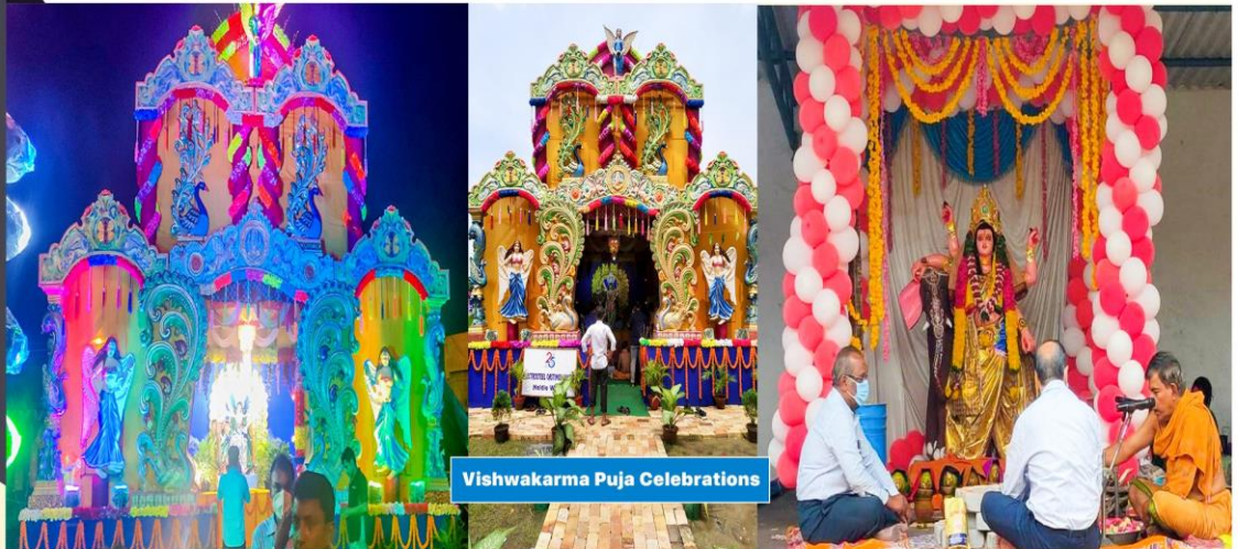
Vishwakarma Puja Celebrations